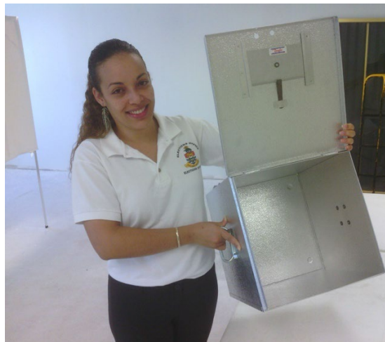
Ballot Box Shown Open & Empty